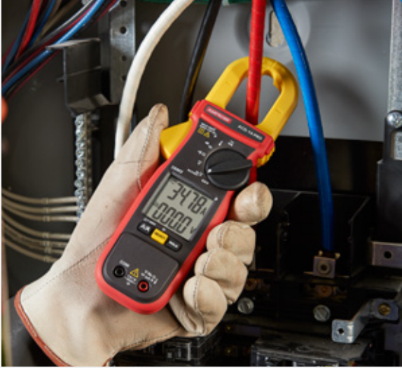
The Amprobe ACD-14-PRO features low profile jaws to test in tight spaces with TRMS for accurate measurements.