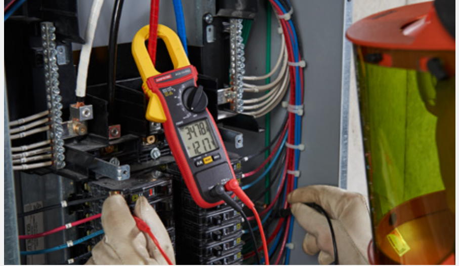
The Amprobe ACD-14-PRO can test and display voltage and current measurements simultaneously with the large backlit LCD dual display, for voltage drop tests and other applications.

Voltage drop test - dual display allows user to view voltage and current simultaneously to assess voltage drop for current changing from zero to a maximum value.