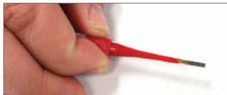
Plastic tool with contact in proper position.