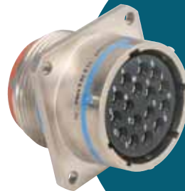
MS3470 wall mounting receptacle with narrow flange