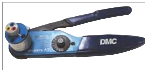
Example M22520 Series Crimping Tool for size 20, 16 or 12 contacts, and has a positioner that can be dialed for each contact size.

** Min. diameters to ensure moisture proof assembly; max. diameters to permit use of metal removal tools.