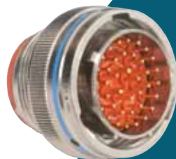
MS3476 straight plug MS3475 plug with RFI grounding fingers