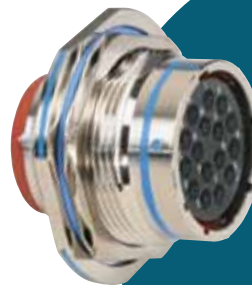
MS3474 jam nut receptacle