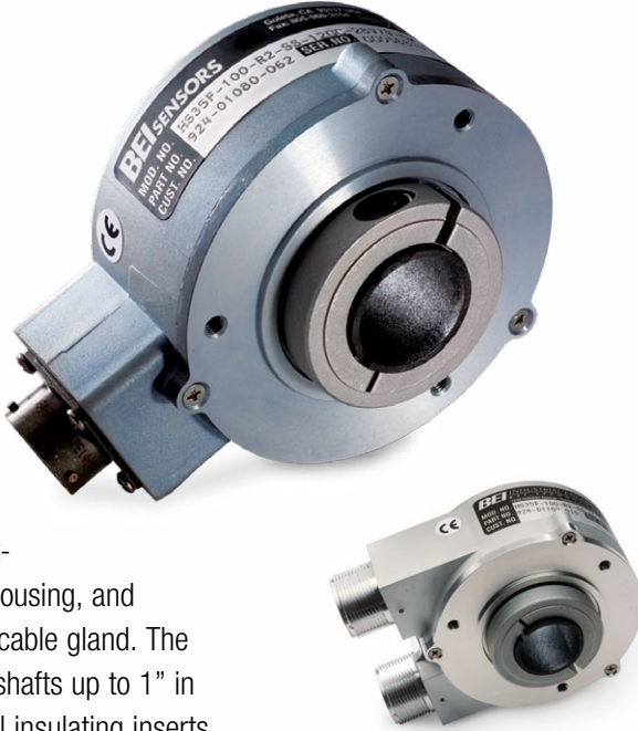
The HS35 Dual Output Encoder

The HS35 combines the rugged, heavy-duty features usually associated with shafted encoders into a hollow shaft style. Its design includes dual bearings and shaft seals for NEMA 4, 13 and IP65 environmental ratings, a rugged metal housing, and a sealed connector or cable gland. The HS35 accommodates shafts up to 1" in diameter. With optional insulating inserts, it can be mounted on smaller diameter shafts. It can be mounted on a through shaft or a blind shaft with a closed cover to maintain its environmental rating. The HS35 is also available with a dual output option (inset) to provide redundant encoder signals, dual resolutions, or to supply two separate controllers from a single encoder. Applications include motor feedback and vector control, printing industries, robotic control, oil service industries, and web process control.