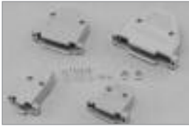
Standard Plastic 'H' Series D-Sub Hoods includes Mounting Hardware, Gray.