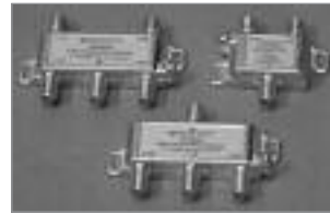
CATV Digital Ready Splitters Horizontal, 5 MHz to 1 GHz

Features solder sealed back plate providing 130db RF shielding, a printed circuit design that ensures performance up to 1 GHz, and a specially plated Zinc housing and 360° port sealing sleeves allow for excellent corrosion resistance. Port spacing allows for easy installation of security shields, and each comes complete with a grounding screw.