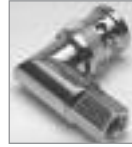
Right Angle, Twist-On BNC (M) 1 Piece, Crimpless & Solderless