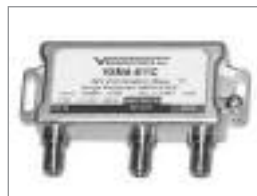
Single Sided Mini Drop Amplifier 54 MHz to 1 GHz (Boxed)

This compact digital ready amplifier has all ports on one side for use in restricted spaces and drop boxes, and features 6 KV combination wave surge protection, triple plated Zinc housing for maximum corrosion protection, precision machined brass 'F' Connectors and an internal Diplexor for increased band isolation. Power Adapter included.