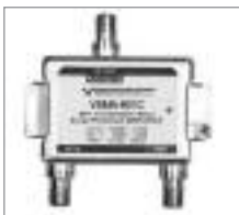
Mini Drop Amplifier 54 MHz to 1 GHz (Boxed)

This compact digital ready amplifier is designed for restricted spaces and drop boxes, and features 6 KV combination wave surge protection, triple plated Zinc housing for maximum corrosion protection, precision machined brass 'F' Connectors and an Internal Diplexor for increased band isolation. Power Adapter included.