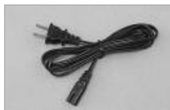
Panasonic Replacement AC Power Cords, 6 ft.