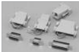
Color: Gray Built to USOC Color Code