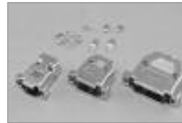
Deluxe Metalized 'HS' Series D-Sub Hoods includes Mounting Hardware, Shield Coating, Silver.