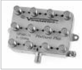
CATV Platinum Plus Splitter Vertical, 5 MHz to 1 GHz

Features solder sealed back plate providing 130db RF shielding, a printed circuit design that ensures performance up to 1 GHz, and a specially plated Zinc housing allows for excellent corrosion resistance. Port spacing allows for easy installation of security shields, and each comes complete with a grounding screw.