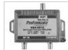
Digital Ready Drop Amplifier 54 MHz to 1 GHz (Boxed)

This full-size Amplifier features 6 KV combination wave surge protection, triple plated Zinc housing for maximum corrosion protection, diecast Zinc plated 'F' Connectors and an Internal Diplexor for increased band isolation. Power Adapter included, and available with or without Power Inserter. Power Adapter included.