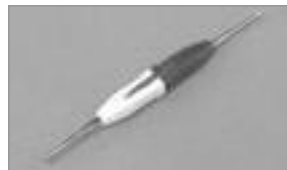
High-Density D-Sub Insertion & Extraction Tool