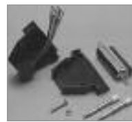
Color: Black Built to Nevada Western Color Code