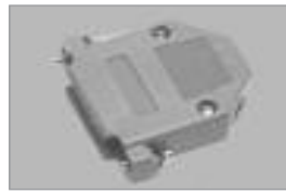
Deluxe Plastic 'HX' Series D-Sub Hoods includes Mounting Hardware & Set Screw to Hold Cable, Gray.