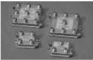
CATV Digital Ready Splitters Vertical, 5 MHz to 1 GHz

Features solder sealed back plate providing 130db RF shielding, a printed circuit design that ensures performance up to 1 GHz, and a specially plated Zinc housing and 360° port sealing sleeves allow for excellent corrosion resistance. Port spacing allows for easy installation of security shields, and each comes complete with a grounding screw.