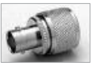
BNC (F) to UHF (M)