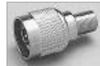
'N' (M) to 'F' (F)