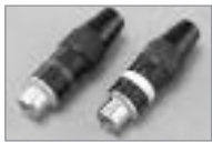
RCA Jack (F) Gold Plated