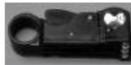
3-Step Cable Stripper with non-adjustable replacement blades RG-8, 11 & 213.