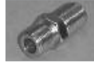
F-81 2GHz 1" Splice for CATV & Satellite (F) to (F)