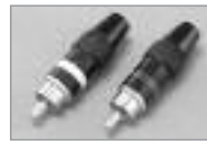
RCA Plug (M) Gold Plated