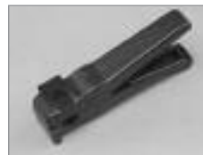
2-Step Cable Stripper with adjustable replacement blades for RG-6, 58, 59 & 62. Poly bagged.