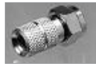
Twist-On F-59TW (M) with 1/2" Grip for Standard RG-59.