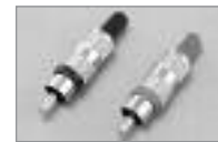
RCA Plug (M) Metal