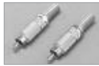
RCA Plug (M) Gold Plated