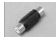
Inline Adapter, Plastic RCA (F) to RCA (F) Gold Plated