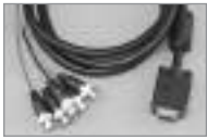
VGA/SVGA Multi-Coax 5 BNC Monitor Cable