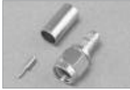
SMA for Flexible Cable (M) Crimp, 3 Piece, Solder or Crimp Center Pin