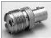
UHF (F) to BNC (F)