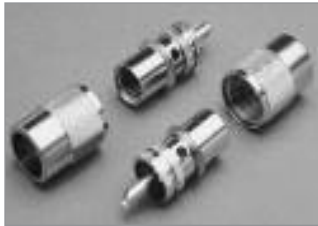
UHF (M) Solder, 2 Piece, PL-259