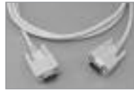
VGA/SVGA Multi-Coax Monitor Cable