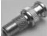
BNC (M) to 'F' (F)