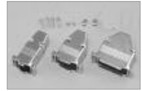
Shielded Metal 'HM' Series D-Sub Hoods includes Hardware, Silver.