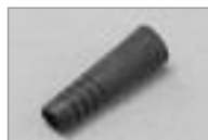
BNC Boots Black Only, 100 per bag