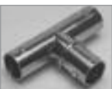
'T' Adapter 3 Female (F-F-F)