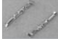
Standard D-Sub Pins for 98 & 99 Series (F) Gold Plated