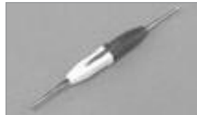
High-Density D-Sub Insertion & Extraction Tool