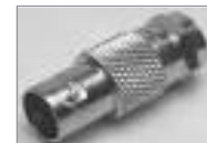
BNC (F) to 'F' (M)