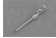
High Density D-Sub Pins for 98 & 99 Series (M) Gold Plated