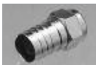
Crimp-On F-56ALM (M) for RG-6 Cable.