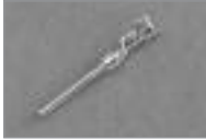
Standard D-Sub Pins for 98 & 99 Series (M) Gold Plated