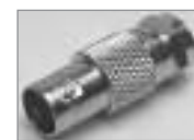
'F' (M) to BNC (F)