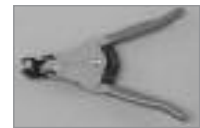
Automatic Wire Stripper Designed for Radio, TV & Computer and Telephone cabling applications to cut and strip insulation automatically.