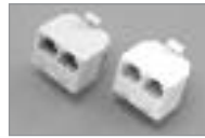
Unshielded Modular Duplex Adapter for splitting Voice, Modem, Fax and Data Lines.