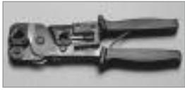
Modular Crimping Tool that cuts, strips and terminates 4, 6, 8, & 8 Keyed Modular Plugs. (Works on AMP™ & Stewart™ Plugs.)

Non-Ratchet No. 24-4680P w/ Ratchet No. 24-4680RP