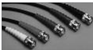
RG-58 Thin Ethernet BNC to BNC Cables Constructed of 50 Ohm, 95% Braid & 100% Foil Shield Cable, 20 AWG Stranded (Belden 9907 Equivalent), Black PVC Cable.