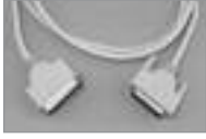
IEEE 1284 Centronics Printer Cable 18 Pair, 28AWEG, Dual-Shielded