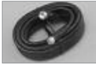
F-59 Hook-Up Cable with Gold Connectors Molded Strain Relief, 75 Ohm, Packaged for Retail Display.