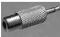
'F' (F) to P3.5 mm (M)