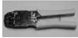
Deluxe Modular Crimping Tool that cuts, strips and terminates 2, 4, 6, 8, and 8 Keyed, 10, DEC 4 & 6 and 4 Conductor Handset Plugs. (Works on AMP™ RJ-45 Plugs only.)

Non-Ratchet No. 24-4681P w/ Ratchet No. 24-4682P