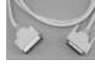
Centronics Printer Cable 25 Conductor, 28 AWG, Shielded