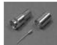
Crimp-On F-11 (M) 3 Piece, for Teflon/Plenum RG-11 Cable.

Part No. Cable Type Tool No. 25-7191 (CPF11ALM) RG-11 24-7711P