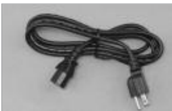
Three Conductor Electrical Equipment Cords Use with Computer Monitors, Printers, Peripheral Devices & other Electronic Equipment, 7 Amp 125 V, 18 AWG.