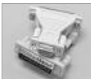
Gender Adapter DB9 (F) to DB25 (M)