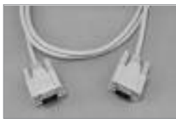
DB9 Data Switch Cable Wired Pin to Pin