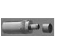
Push-On F-59PG (M) or RG-59 Cable with Center Pin.