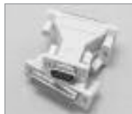
Gender Adapter DB9 (M) to DB25 (F)