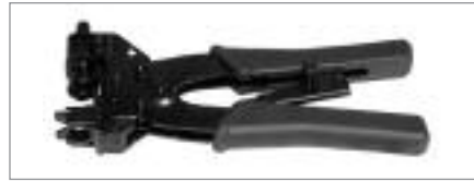
All-In-One Adjustable Ratchet Crimp Tool for all types of BNC, F and RCA Compression Connectors