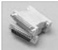
Null Modem Adapter DB25 (M) to DB25 (F)