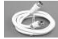
RG-59 Hook-up Cables with Molded Strain Relief 75 Ohm, Packaged for Retail Display.