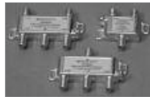
CATV Digital Ready Splitters Horizontal, 5 MHz to 1 GHz

Features solder sealed back plate providing 130db RF shielding, a printed circuit design that ensures performance up to 1 GHz, and a specially plated Zinc housing and 360° port sealing sleeves allow for excellent corrosion resistance. Port spacing allows for easy installation of security shields, and each comes complete with a grounding screw.