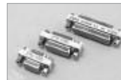
D-Sub Mini Gender Changers