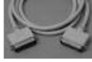
Centronics Printer Cable 36 Conductor, 28 AWG, Shielded