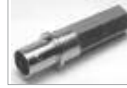
Twist-On BNC (F) 1 Piece, UG-89