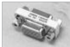
High Density D-Sub (SVGA) Mini Gender Changers & Port Saver