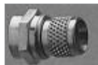
Twist-On F-59TW (M) for Standard RG-59 Cable.