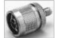
'N' (M) to SMA (F)