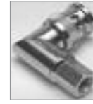
Right Angle, Twist-On BNC (M) 1 Piece, Solderless