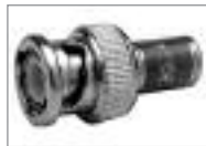
BNC Terminators 1/2 W @ 1%, with and without Grounding Strap