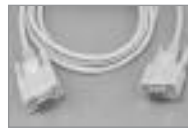
DB9 Extension Cable (F) Wired Pin to Pin