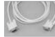
DB9 Data Extension Cable Wired Pin to Pin