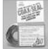
COAX Seal 1/2" x 60" Moldable plastic. Seals fittings from moisture, Sold in 12 packs