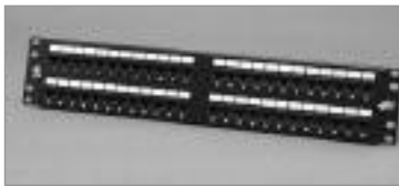
19" Rack Mount Cat5E Patch Panels RJ-45/110 IDC, EIA 568A/B

Each 110 IDC is color coded for EIA 568A & 568B termination, and each panel is individually boxed and includes 110 IDC dust caps, mounting screws, and a disposable 110 IDC termination tool.