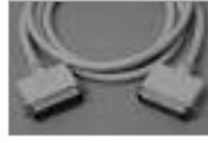
Centronics Printer Cable 36 Conductor, 28 AWG, Shielded