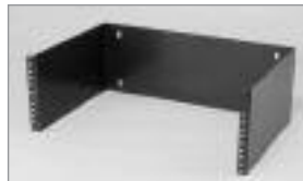
Hinged Wallmount Patch Panel Bracket 12" depth, EIA/TIA Threaded Hole Pattern, Metal, Black