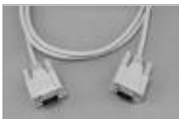
DB9 Data Switch Cable Wired Pin to Pin