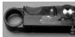
2-Step Cable Stripper with adjustable replacement blades for standard & Teflon RG-59, RG-6 & Belden 8281.