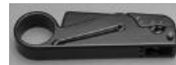
2-Step Cable Stripper with non-adjustable replacement blades RG-8, 11 & 213.