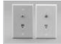
Dual Port Telco & CATV Wallplate RJ-11 & F-81, Flush Mount, Plastic