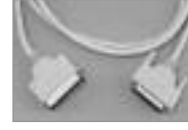
Centronics Printer Cable 25 Conductor, 28 AWG, Shielded