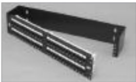
Hinged Wallmount Patch Panel Bracket 5" depth, EIA/TIA Threaded Hole Pattern, Metal, Black