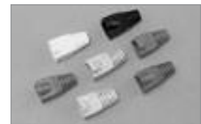
Colored Snagless Boots for RJ-45 8 Conductor Shielded and Unshielded Modular Plugs.