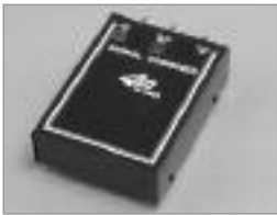
Channel 3 Signal Combiner

Has six-stage bypass/bandstop filter with adjustable balancing attenuators, enabling the use to combine a channel 3 output signal from a STV, MDS, VCR or Video Game device with an existing MATV System containing adjacent channel 2 and 4. The filtering system provides excellent harmonic reduction from all types of modulators used in STV, MDS or VCR units. Individually boxed.