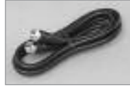
F-59 Hook-Up Cable with Molded Strain Relief 75 Ohm, Bulk Packaged.