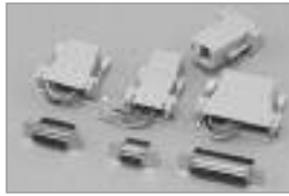
Color: Gray Built to USOC Color Code