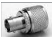
UG-273/U Adapter UHF (M) to BNC (F)