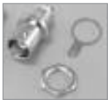
Solder to BNC (F) 3/8" Mounting Hole, UG-1094U