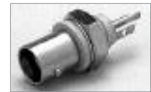
Isolated BNC (F) 3/8" Chassis Mount Hole