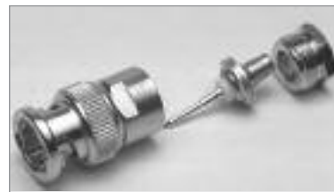
Solder or Crimp BNC (M) 3 Piece