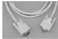
VGA/SVGA Multi-Conductor Extension Cable