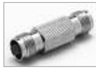
TNC Inline Splice TNC (F) to TNC (F)