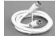
RG-59 Hook-up Cables with Molded Strain Relief 75 Ohm, Packaged for Retail Display.