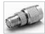
TNC (M) to Mini-UHF (F)