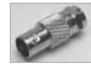
BNC (F) to 'F' (M)