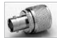
BNC (F) to UHF (M)