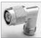
TNC Right Angle TNC (M) to TNC (F)