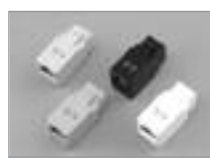
Unshielded Cat 5e RJ-45 Keystone Feed Through Adapter