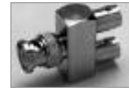
BNC Goalpost 'T' Adapter 1 Male - 2 Female (F-M-F)