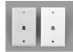
Single Port Category 4 Telephone Wallplate Smooth Finish