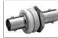
Isolated Dual BNC (F) 1/2" & 5/8" Chassis Mount Hole