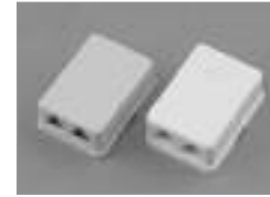
Dual Cat4 RJ-45 Surface Box 4 or 8 Conductor Screw Termination