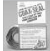
COAX Seal 1/2" x 60" Moldable plastic. Seals fittings from moisture, Sold in 12 packs