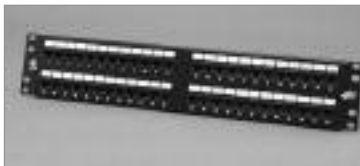
19" Rack Mount Cat5E Patch Panels RJ-45/110 IDC, EIA 568A/B

Each 110 IDC is color coded for EIA 568A & 568B termination, and each panel is individually boxed and includes 110 IDC dust caps, mounting screws, and a disposable 110 IDC termination tool.