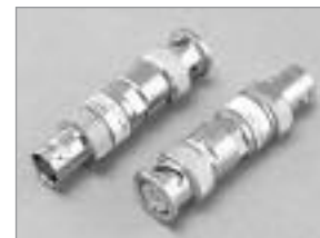
BNC (M) to BNC (F) Attenuator Pads 1/2 W @ 5%, 50 Ohms