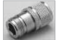
'N' (F) to UHF (M) UG-83/U