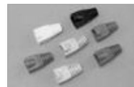
Colored Snagless Boots for RJ-45 8 Conductor Shielded and Unshielded Modular Plugs.