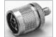
'N' (M) to SMA (F)