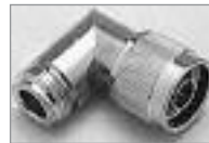
Right Angle 'N' (M) to 'N' (F), UG-27/U