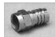
Crimp-On F-56ALM (M) for RG-6 Cable, Zinc Plated.