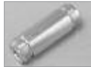
Inline Splice 'N' (F) to 'N' (F), UG-29B/U