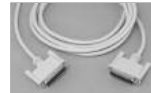
DB25 Data Switch Cable 25 Conductor, 28 AWG, Shielded