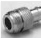
'N' (F) to BNC (F) UG-606/U