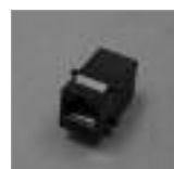
Unshielded Cat 4 RJ-45 Keystone Feed Through Adapter Black