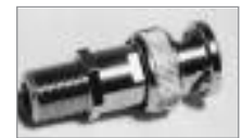
'F' (F) to BNC (M)