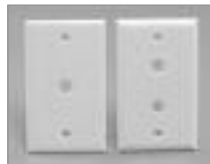
Blank F-81 Wallplate 3/8" Center hole, Flush Mount, Plastic