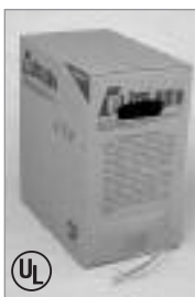
Cat5E & Cat6 Stranded Patch Cable 4 pair, 24 AWG Unshielded, EIA/TIA 568, 1,000 ft. "Reel in Box" with cable length markings.