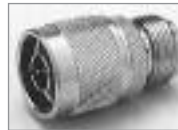
'N' (M) to UHF (F) UG-146/U