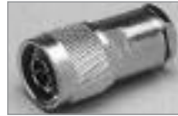
'N' (M) Solder Center Pin, UG-21B/U