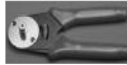
D-Sub Crimping Tool for Precision Machined Contacts , 4 Way Indent, Crimps 20-26 AWG with Built-in Contact Locator.