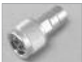
'N' Terminator (M) 1W @ 2%