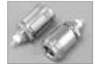
Chassis Mount 'N' (F)