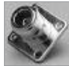
Chassis Mount 'N' (F) to Solder Lug UG-58B/U