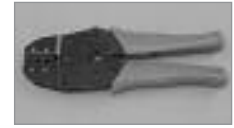
Insulated Terminal Ratchet Crimping Tool Crimps 10-22 AWG fully insulated terminals in an ovalized crimp.

Blister No. 24-8622P Replacement Die No. 99-8622