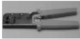
Modular Crimping Tool that cuts, strips and terminates 2, 4, 6, 8, & 8 Keyed Modular Plugs. (Will not work on AMP™ RJ-45 Plugs.)

Non-Ratchet No. 24-4680P w/ Ratchet No. 24-4680RP