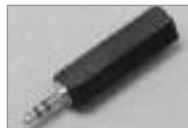
1/4" Stereo Jack (F) to 3.5 mm Plug (M)