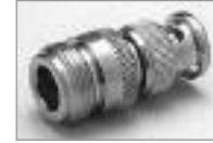
'N' (F) to BNC (M) UG-349/U