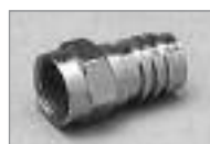
Crimp-On F-56 (M) for Teflon/Plenum RG-6 Cable.