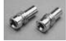
UG-175 Reducer Used with a PL-259