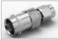
SMA (M) to BNC (F)