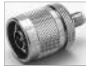
SMA (F) to 'N' (M)