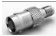
SMA (F) to BNC (F)