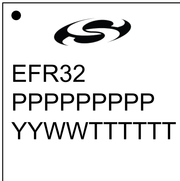
Figure 8.3. QFN32 Package Marking