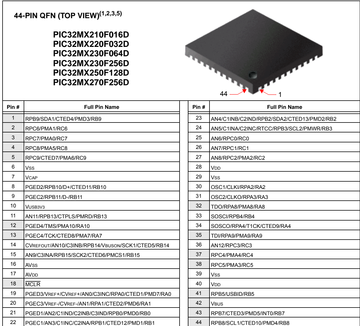
TABLE 10: PIN NAMES FOR 44-PIN USB DEVICES