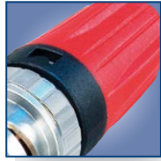
9 different colors available