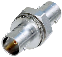
Bulkhead Jacks - NBB75FG