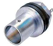
Cable jacks Panel Version – NBB75SI