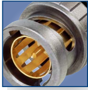
Precise Swiss machined parts