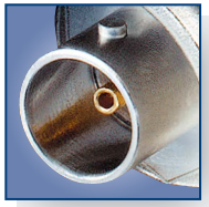
Gold plated center pin