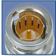
Gold plated contacts