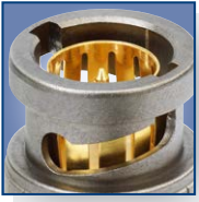
Gold plated contacts