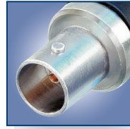
Female cable jack