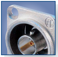
D-shape metal housing