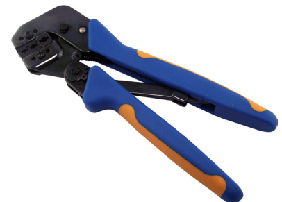
58433-3 - Pro-Crimper Commercial Hand Tool