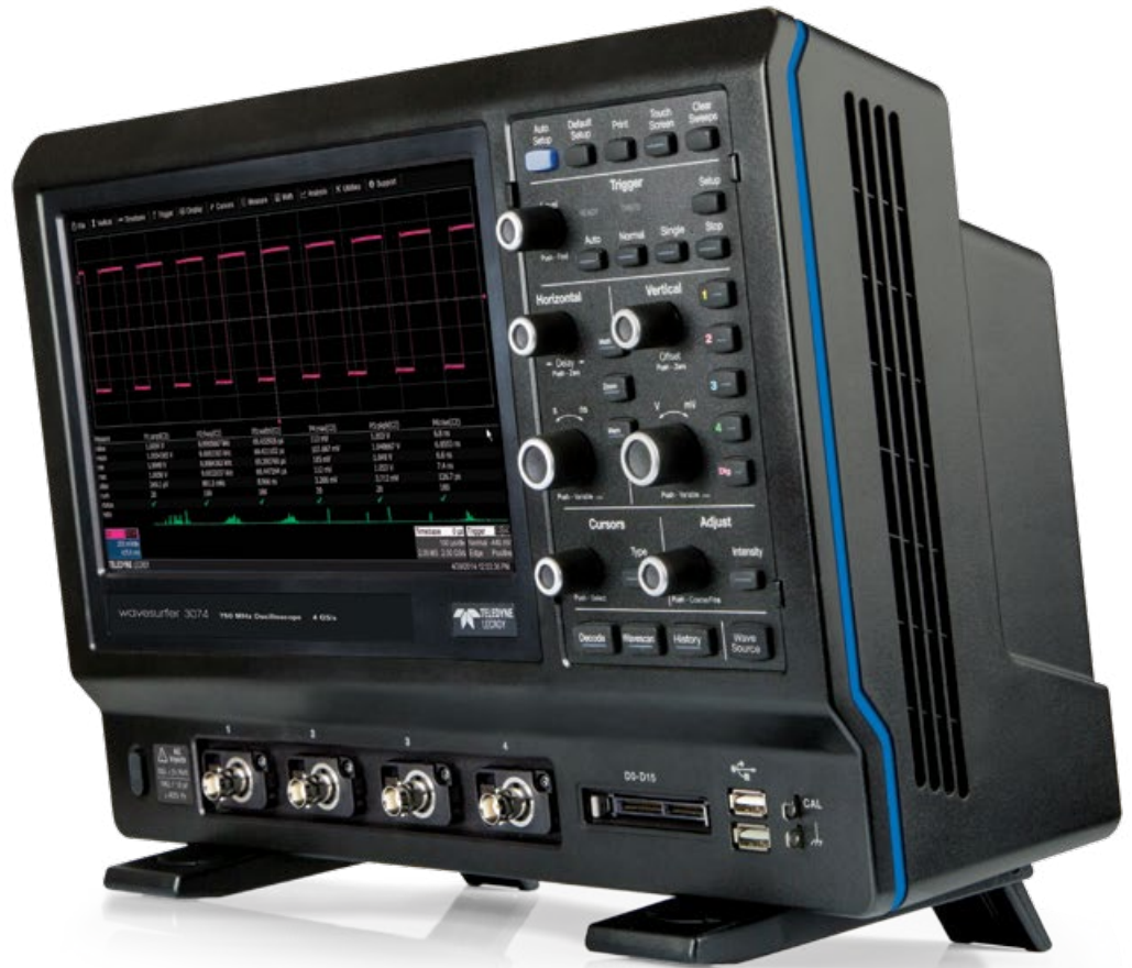
Rotating and tilting feet provide four different viewing positions.

A fast update rate ensures that no waveform variations or details are missed. With an update rate of up to 130,000 waveforms per second the WaveSurfer 3000 is able to easily display random or infrequent events simplifying anomaly detection, identification and debug. Rapidly changing waveforms are easy to see and visually inspect. Changes over time can be seen with the intensity graded persistence display.