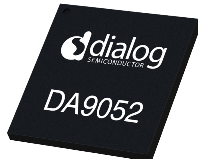
VFBGA 7 mm x 7 mm, 0.5 mm pitch package

An integrated 10-channel general purpose ADC includes support for a touch screen controller with pen down detect, programmable high/low thresholds, an integrated current source for resistive measurements, and system voltage monitoring with a programmable low voltage warning. The ADC has 8-bit resolution in auto mode and 10-bit resolution in manual conversion mode.