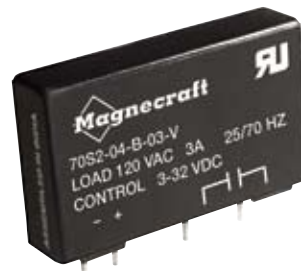
70S2 V (3 Amp)