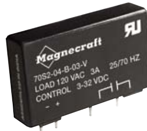
70S2 V (3 Amp)