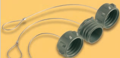
EXP-0990, EXP-0991, EXP-0992