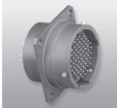
JT with Filter Protection

Filter and/or voltage surge arresting devices are integrated into a JT or an LJT connector to eliminate conventional bulky exterior filtering systems. This unique design reduces weight, space and user testing while providing system protection from EMI/ EMP. Ask for publication 12-120 or contact Amphenol, Sidney, NY for complete information on Amphenol EMI Filter/Transient Protection Connectors.