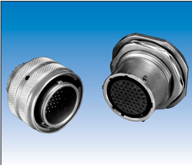
Amphenol® LJT Connector

Amphenol® LJT and JT Series subminiature cylindrical connectors are qualified to MIL-DTL-38999*, Series I and II respectively. These connectors were developed to meet the needs of the aerospace industries, and provided the impetus for development of the MIL-C-38999 specifications, which recently were superseded by MIL-DTL-38999. Meeting or exceeding MIL-DTL-38999 requirements, Amphenol® JT/LJT connectors feature: