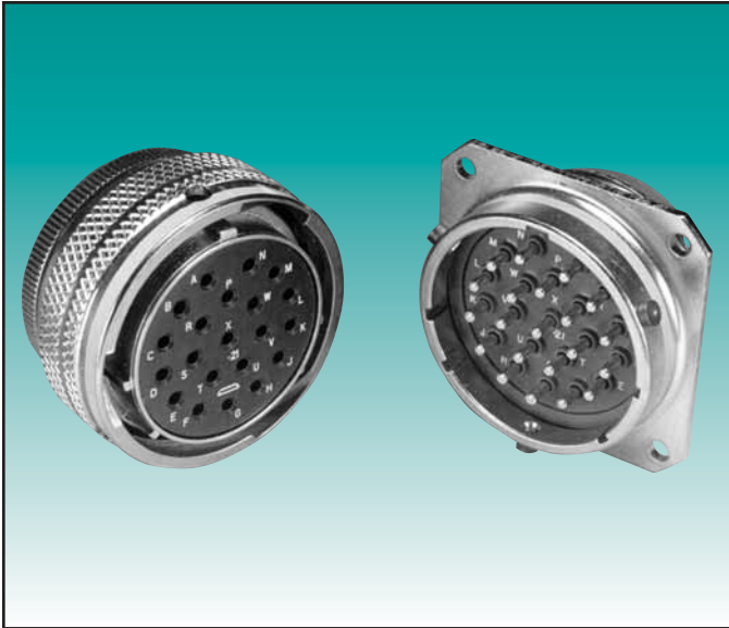
Amphenol® JT Connector

high reliability and high contact density with maximum weight and space savings