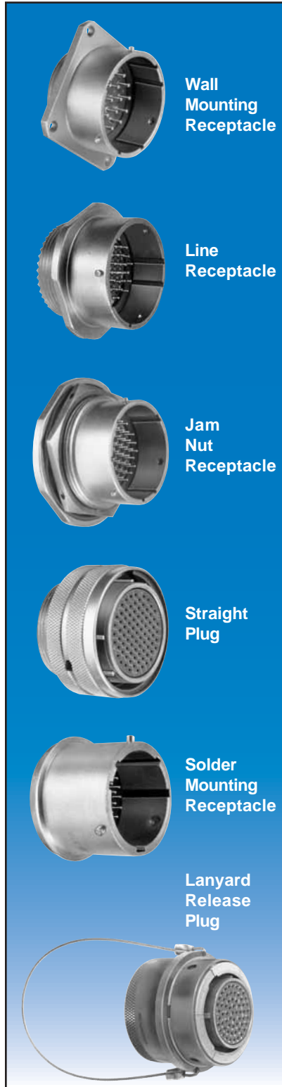
Wall Mounting Receptacle