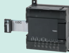
CP1W-TS001 Thermocouple inputs: 2 CP1W-TS002 Thermocouple inputs: 4 CP1W-TS101 Platinum-resistance thermometer inputs: 2 CP1W-TS102 Platinum-resistance thermometer inputs: 4