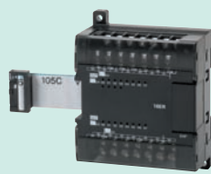
CP1W-16ER Relay outputs: 16