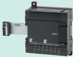
Analog I/O Unit CP1W-MAD11 Analog inputs: 2 (resolution: 6,000) Analog outputs: 1 (resolution: 6,000)