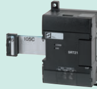
CP1W-SRT21 Inputs: 8 bits Outputs: 8 bits