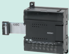
Analog Input Unit CP1W-AD041 Analog inputs: 4 (resolution: 6,000)