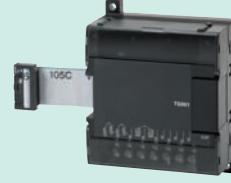
CP1W-TS001 Thermocouple inputs: 2 CP1W-TS002 Thermocouple inputs: 4 CP1W-TS101 Platinum-resistance thermometer inputs: 2 CP1W-TS102 Platinum-resistance thermometer inputs: 4