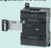
CP1W-8ED DC inputs: 8