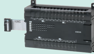
CP1W-20EDT DC inputs: 12 Transistor outputs (sinking): 8