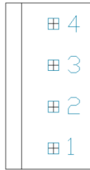
Figure 13: Alternate Power Connector

The Alternate Power Connector provides the ability to power the GTT70A using a second cable. This connection is required for USB protocol due to the power requirements of the GTT70A.