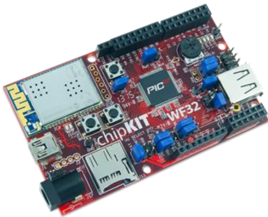
The chipKIT WF32 board.

The chipKIT WF32 is based on the popular Arduino™ open-source hardware prototyping platform and adds the performance of the Microchip PIC32 microcontroller. The WF32 is the first board from Digilent to have a WiFi MRF24 and SD card on the board both with dedicated signals. The WF32 board takes advantage of the powerful PIC32MX695F512L microcontroller. This microcontroller features a 32-bit MIPS processor core running at 80Mhz, 512K of flash program memory, and 128K of SRAM data memory.