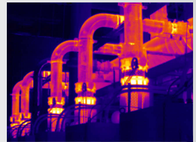
MultiSharp Focus, available on the Ti450 PRO