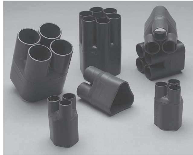
3M™ Heat Shrinkable Cable Breakout Boots

3M Heat Shrinkable HDBB Cable Breakout Boots are designed for dependable insulating and sealing of cable breakouts in multiconductor armored or sheathed cables and conduit ends. 3M HDBB boots are made from flame retardant, cross-linked polyolefin and meet the material requirements of MIL-I-81765-1. The boots are designed to provide excellent electrical and mechanical protection and are supplied with an internal coating of adhesive for reliable environmental sealing.