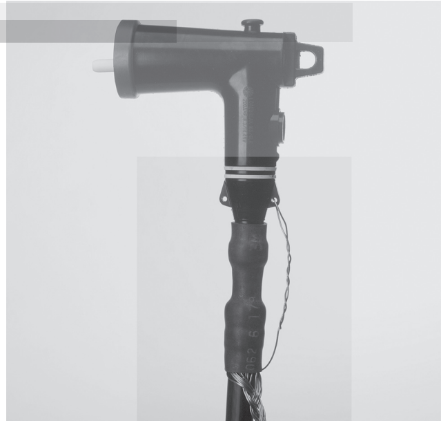
Note: Elbow not included.

The 3M Cold Shrink Cable Accessory Sealing Kits 8450 Series are designed to seal the jacket end of power cables where elbows or other cable accessories are installed. Both the sealing tube and mastic are compatible with commonly used power cable jacketing and semiconductive materials.