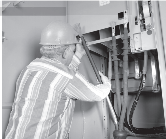
3M™ QT-III Silicone Rubber

3M Breakout Boots 8560 Series are designed to protect the phase leg breakout of 3/C medium voltage power cable from exposure to moisture, contamination, corrosion, ozone, ultra-violet radiation, physical contact and other hazards associated with 3/C termination operating environments. 3M Breakout Boots 8560 Series can be used in conjunction with 3M Silicone Rubber Cold Shrink Rejacketing Sleeves for 3/C shielded power cable terminating applications.