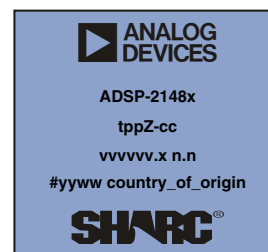
Figure 3. Typical Package Brand

The information presented in Figure 3 provides details about the package branding for the ADSP-2148x processors. For a complete listing of product availability, see Ordering Guide on Page 66 .