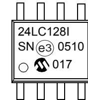
8-Lead SOIC (5.28 mm)