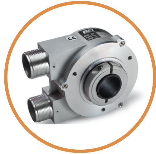
The HS35 Dual Output Encoder