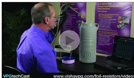
FIGURE 7 - PRECISION RESISTOR IN CRYOGENIC CONDITIONS - ONLY 5 PPM/°C (PRODUCT DEMO)

Different expansion/contraction rates of composite materials in resistors may induce discontinuities during temperature excursions that are not evident at temperature extremes, making an unreliable resistor appear normal. A good resistor must also return to its initial value with no resistance drift. In this demo, a VFR VSMP0805 precision resistor is monitored through the range of +25°C, down to -196°C and back up to +25°C. Results confirm the VSMP0805 exhibits only 5 ppm/°C TCR, experiences no discontinuities, and returns to its exact same starting value, showing absolutely no change in resistance (< 1 ppm measurement accuracy).