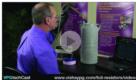
FIGURE 7 - PRECISION RESISTOR IN CRYOGENIC CONDITIONS - ONLY 5 PPM/°C (PRODUCT DEMO)

Different expansion/contraction rates of composite materials in resistors may induce discontinuities during temperature excursions that are not evident at temperature extremes, making an unreliable resistor appear normal. A good resistor must also return to its initial value with no resistance drift. In this demo, a VFR VSMP0805 precision resistor is monitored through the range of +25°C, down to -196°C and back up to +25°C. Results confirm the VSMP0805 exhibits only 5 ppm/°C TCR, experiences no discontinuities, and returns to its exact same starting value, showing absolutely no change in resistance (< 1 ppm measurement accuracy).