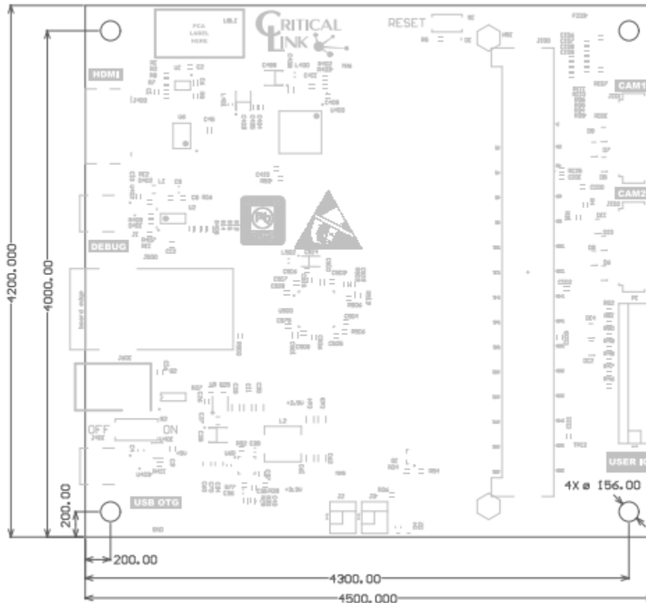
Figure 2: MitySOM-5CSX VDK Baseboard, Mounting Hole Locations (Top View)

Figure 2 illustrates the location of the mounting holes and the outer dimensions of the Embedded VDK Baseboard (all dimensions are in mils).