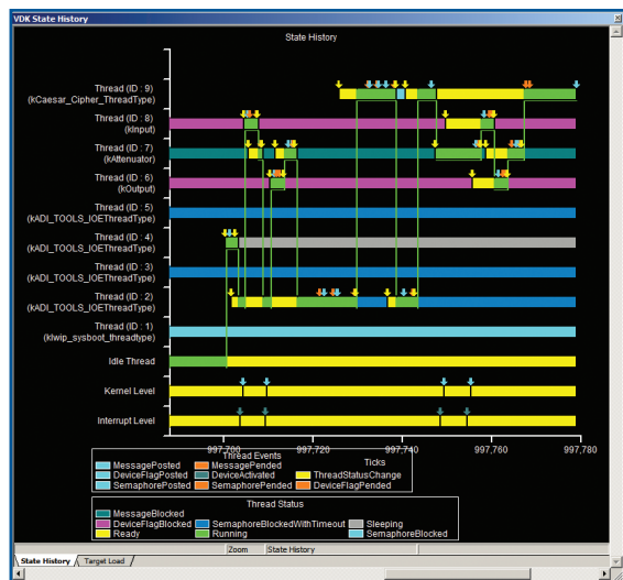
Kernel event history.

For Blackfin Processors and SHARC Processors, inspection, or even