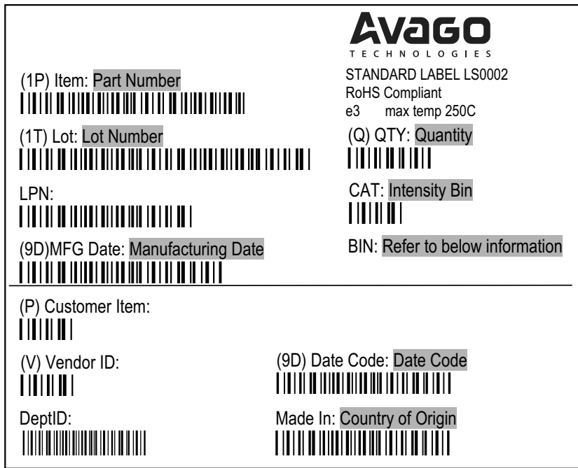
Figure 16: Baby Label (Only available on bulk packaging)