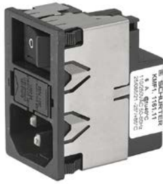
Protection class I with shield