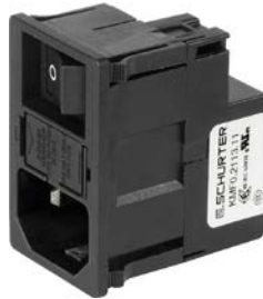
Protection class II without shield