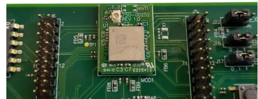
Figure 1: 455-00030 Sterling-EWB Development Kit w/ Chip Antenna