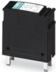
Protective plug PT with HF protective circuit for 4 signal wires. Nominal voltage: 12 V DC

Please be informed that the data shown in this PDF Document is generated from our Online Catalog. Please find the complete data in the user's documentation. Our General Terms of Use for Downloads are valid ( http://download.phoenixcontact.com )