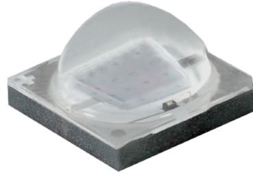
XT-E Royal Blue