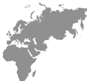
Europe Middle East Africa