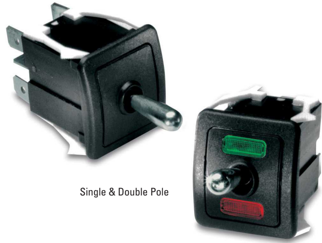
Single & Double Pole

A choice of models are offered to handle current from 16 amps to low level electronic switching levels.