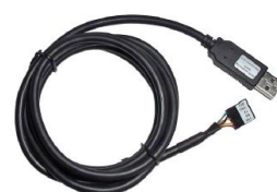
4D Programming Cable

Using a non-4D programming interface could damage your processor, and void your Warranty.