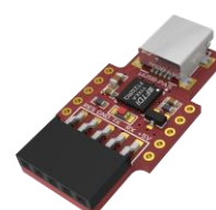
uUSB-PA5 Programming Adaptor