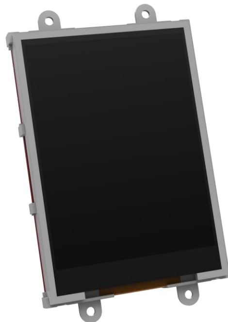
The uLCD-32-PTU Display Module